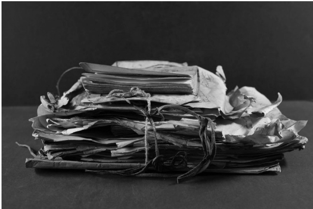
TNA, HCA 30/642: Court bundle of papers.